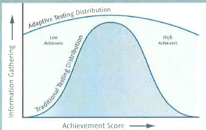
Adaptive tests provide more precise measurement in making individual status and progress decisions for all students, but particularly for lower and higher performing students.

MAP measures growth on a longitudinal scale, regardless of changes to standards. A score of 200 on today's Common Core MAP assessment has the same meaning as a MAP score of 200 from 30 years ago.