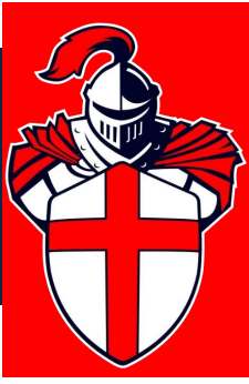
PHOTO CONSENT FORM

I give Crossroads Christian School, a non-profit, religious organization permission to use pictures/video of myself or my child/children for possible inclusion on the CCS website, promotional materials and media, in publications, including electronic publications and online applications. In addition I grant to CCS, its employees, agents, successors, licensees, and assignees the right and license to use the likeness of me or my child/children in photographs and/or video; to crop such photographs at CCS's discretion; to incorporate such photographs into CCS publications at their discretion; and to use such photographs/video or any portion thereof in any manner, including posting on the CCS website, applications, or inclusion with the article on an electronic storage medium such as a DVD, flash drive or other electronic format. I agree to hold CCS, its employees, agents, successors, licensees, and assignees harmless against any liability, loss, or damage resulting from the use of my or my child/children likeness, and hereby release and discharge any claims whatsoever in connection with such use of my likeness or my child's likeness in the above projects. I am signing this release freely and voluntarily, and I am not relying on any inducements, promises, or representations made by CCS, its employees, or agents.