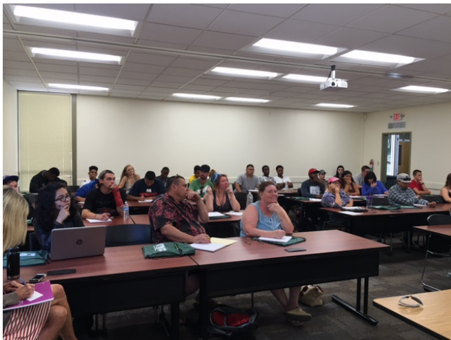
Summer Bridge math session