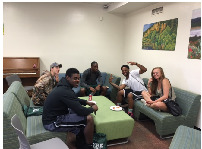
Summer Bridge students enjoying new lounge furniture