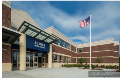
Auburn Middle School