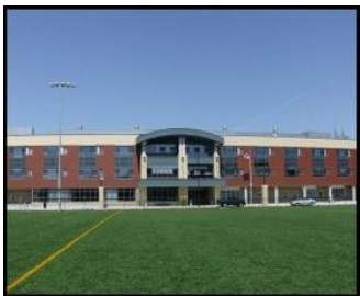
Auburn High School