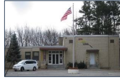
Bryn Mawr School