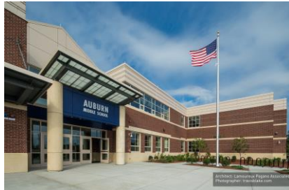
Auburn Middle School