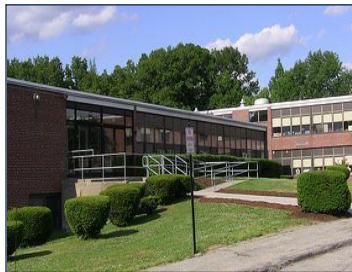
Swanson Road Intermediate School