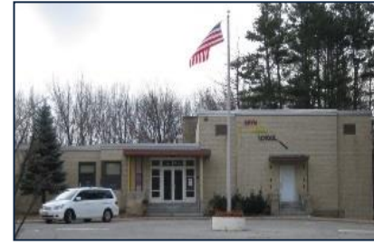
Bryn Mawr School