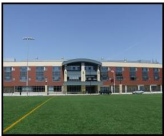
Auburn High School