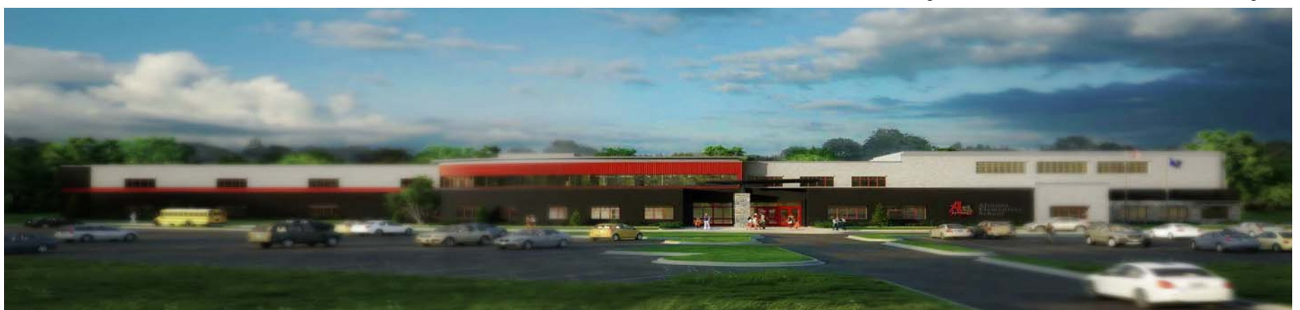
Altoona Elementary School, which will house our K-3 student population, is slated for occupancy at the start of the 2016/17 school year.