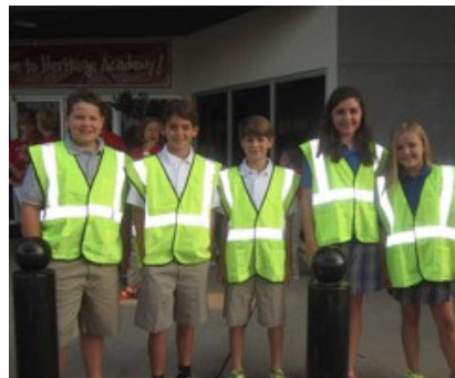
Different groups of our 6th Grade Safety Patrol will be assisting students as they get