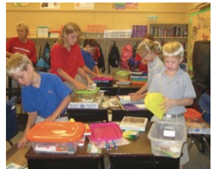
Organizing school supplies is an important task on the 1st day!