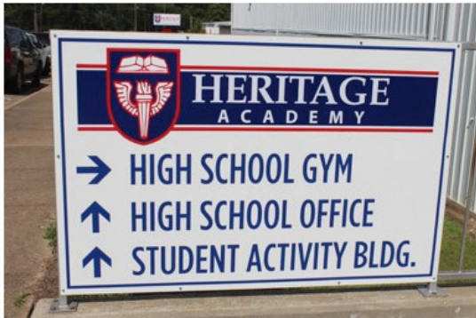
Signs like this one were recently added to help identify and point the way to buildings on campus.

Thank you to all our faculty, staff and parents who worked over the summer to help with the successful launch of our 2013-2014 school year. It takes the hands of many to help get the classrooms, grounds and students prepared.