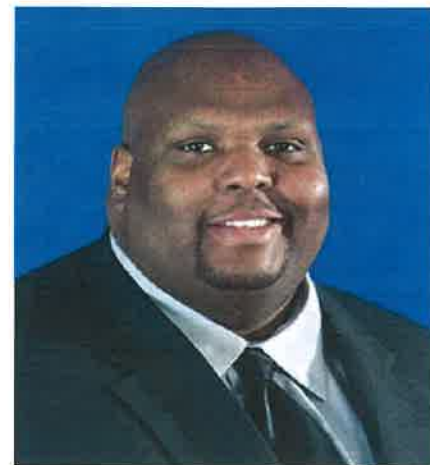
LAWRENCE L. JACKSON MAYOR

**SEATING WILL BE LIMITED** MASK AND SOCIAL DISTANCING WILL BE REQUIRED