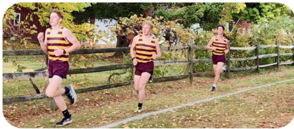
North East Cross Country Celebrates Senior Night!