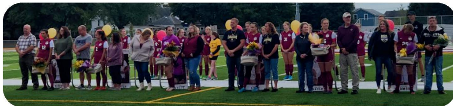
North East Girls Soccer Celebrates Senior Night!