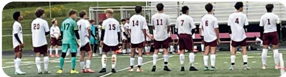
North East Boys Soccer Celebrates Senior Night!