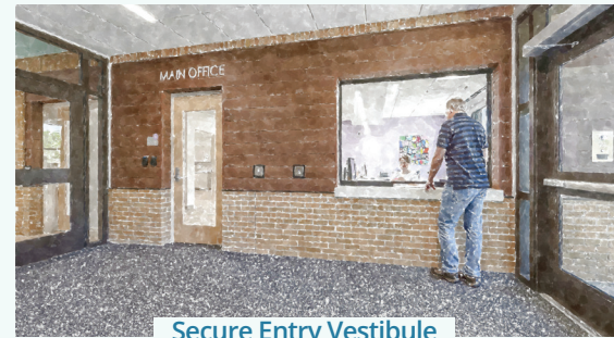
Secure Entry Vestibule

○ Belle Aire and El Sierra Elementary Schools are already air conditioned and require limited HVAC-related upgrades.