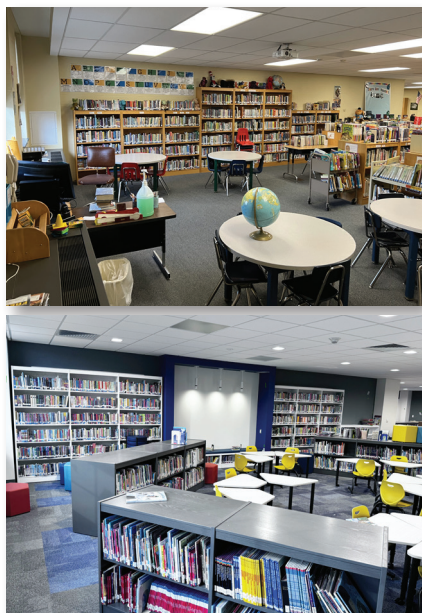
Library, before and after