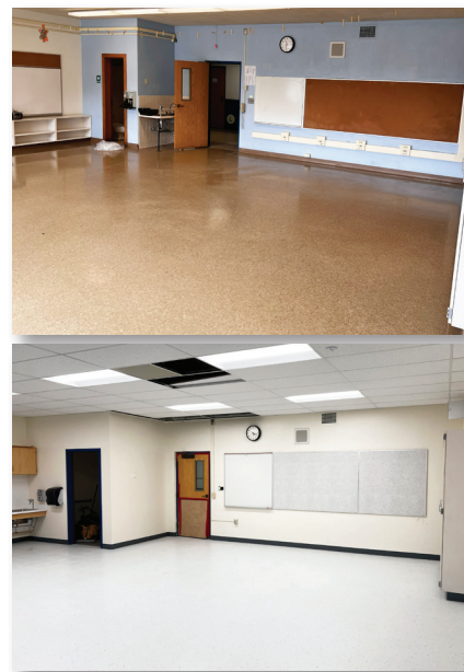
Elementary classroom, before and after