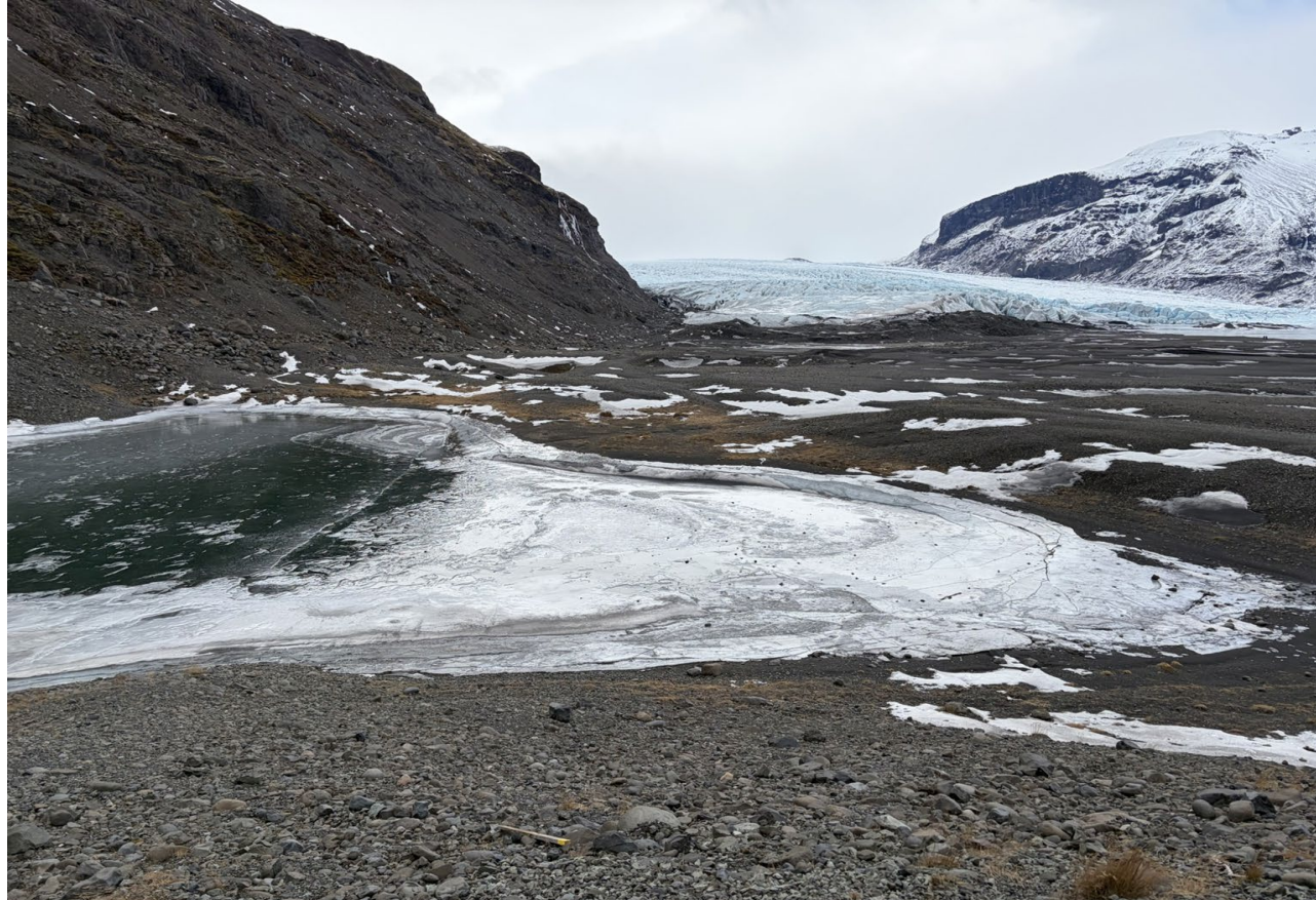
Jökulsárlón Glacier Lagoon