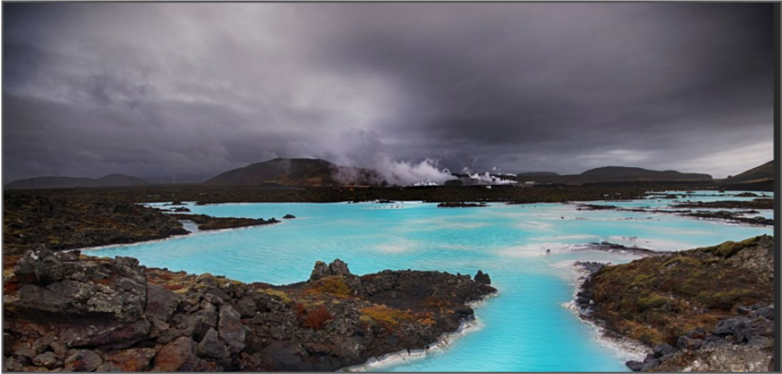
Blue Lagoon, Grindavík (man-made geothermal water pool located in a volcanic landscape)