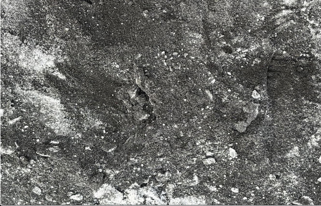
Volcanic basalt, lava fragments and ash