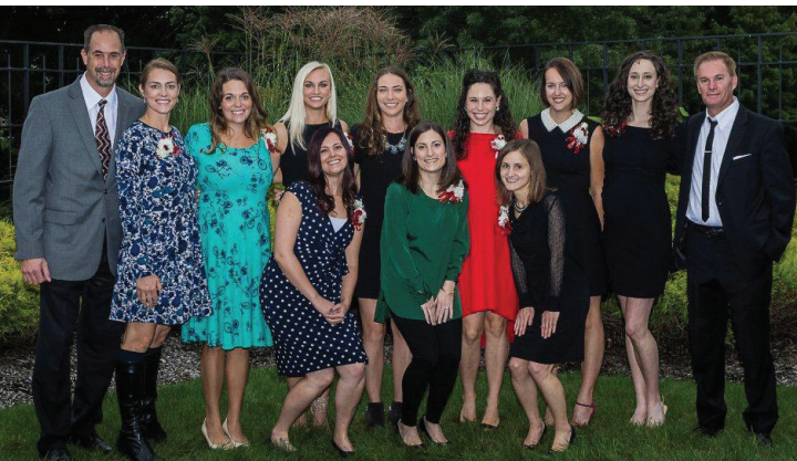
2001 PHS Girls' Cross Country Team