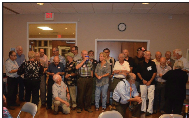
Gathering our PHS veterans for some well deserved recognition