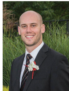
Athletic Contributions: Track: 1999, 2000, 2001, 2002 Football: 1999, 2000, 2001