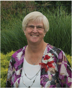
Coach and Administrator