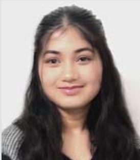
PYO PA PA