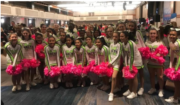
The Varsity and Junior Varsity cheerleading squad performing at the national Macy's Day parade.

STUDENTS INTERESTED IN STARTING SPORTS PROGRAMS, PLEASE BRING YOUR WRITTEN PROPOSAL TO ATHLETICS DIRECTOR YOUNG OR WORKMAN IN ROOM 403! WE LOVE HELPING BRING YOUR DREAMS INTO REALITY!