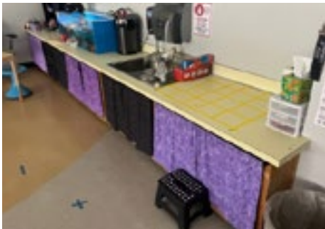
Casework is from the 1950s