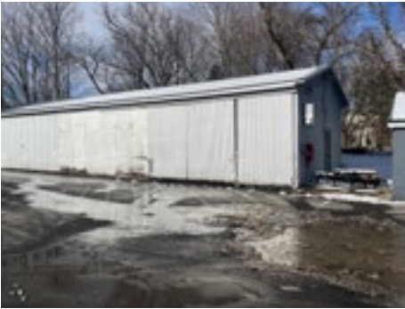
Demolish outdated sheds and add new cold storage pole barn with electricity and lighting