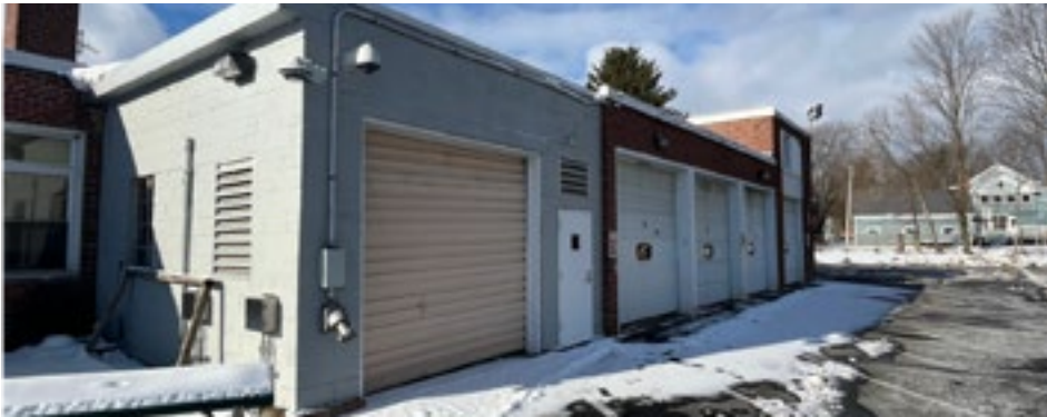
Bus Garage to be demolished in its entirety and the new construction will include improvements for the stadium