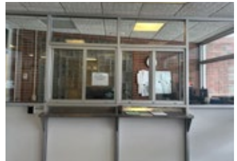
Secure vestibule is in need of upgrades