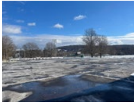
Parking lot in need of reconstruction