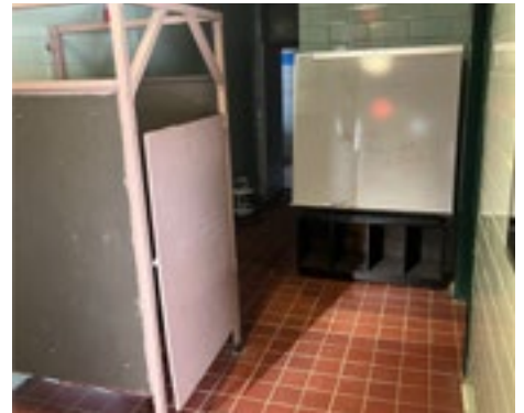
Outdated toilet room in Bus Garage