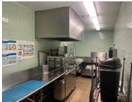
Kitchen in need of renovations and new equipment