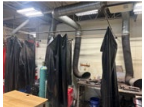
Welding stations in need of ventilation/safety upgrades