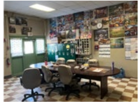
Outdated office environment in Bus Garage