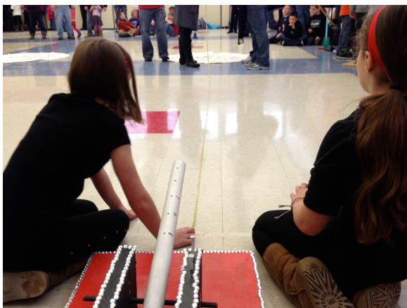
Rubber Band Catapult