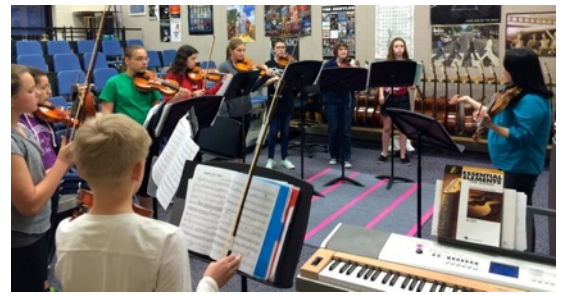
Emerson’s orchestra students received inspiration and tips from a PRCO musician.