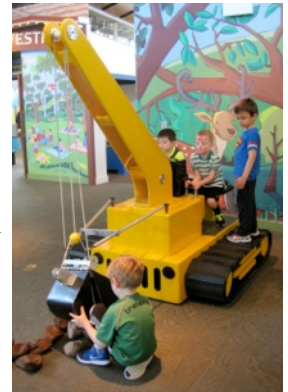
An interactive afternoon of learning and fun at the Kohl Museum offered hands on activities for Jefferson children to use their imaginations and develop skills.