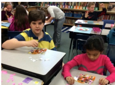
Washington students play bingo to build their Spanish vocabulary.

❖ Washington - Students were hard at work with hockey and volleyball units in PE. Kindergartners were nice and cozy in their pj's while they worked on their learning!