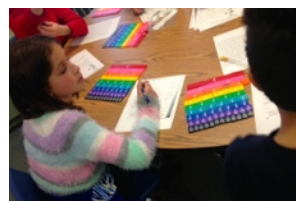
Franklin 4th graders use manipulatives to tackle fractions.