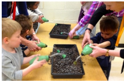
Thank you to ELF for funding this partnership!

My visits to schools allowed me to see our students at all grade levels facing new challenges, as we entered the final trimester of our school year. Here are some of the highlights: