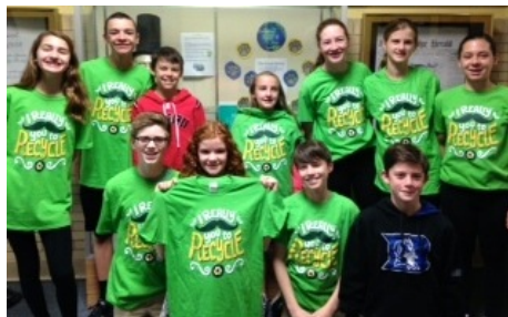
Lincoln’s Green Team created daily “spirit” events to celebrate Earth Week and boost awareness of sustainability activities.

❖ Emerson - Channels of Challenge students were working on a film project in small groups, while grade 7 science students were engaged in “bacteria mania.”