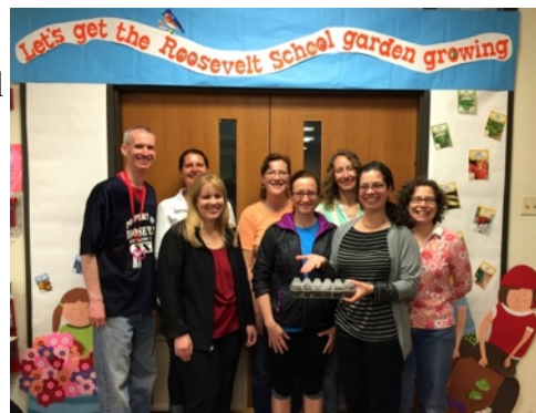
Roosevelt's gardeners are anxious to get growing!

Kindergarten families collected egg cartons, which each classroom is using to plant a variety of seeds. In addition, Roosevelt is purchasing four garden beds. The beds will be prepared in May for students to begin planting in June. During the summer, Roosevelt families will help maintain it. And come fall, the school hopes to include some herbs and other food items from the garden into the PTO hot lunch offerings.