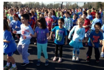
Franklin students warmed up at a rally before their Track-a-thon fundraiser focusing on wellness.