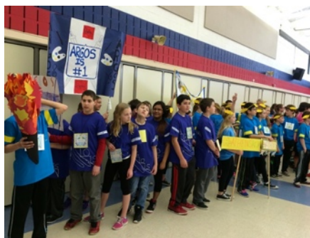
Emerson students gather for the opening ceremony of the annual 6th Grade Olympics , which is the highlight of their interdisciplinary study of Ancient Greece. Read more!