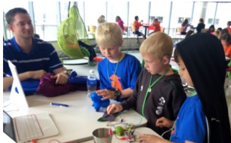
Roosevelt's lunchtime Coding Club visited Google's offices in downtown Chicago to see the professional world of working with computers and enjoy hands-on projects.