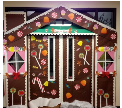
A gingerbread doorway to Roosevelt School's Learning Resource Center made the entrance inviting and fun this month!