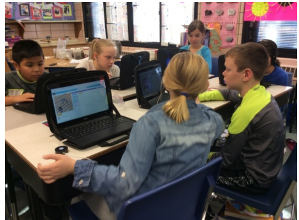
(Above) Franklin students explore coding resources. View more Hour of Code images from across District 64 in our online PHOTO GALLERY.

The Hour of Code is a global movement promoting computer science instruction in all schools, spreading an awareness that anybody can learn to code, and giving our students the opportunity to explore possible careers in computer programming fields. Whether using iPads, laptops, Chromebooks or in the computer lab, students across the grades enjoyed fun and engaging learning experiences focused on coding and programming. Students utilized tools developed around popular resources, like Minecraft, Star Wars, and other familiar themes. There were options for every age and experience level to explore!