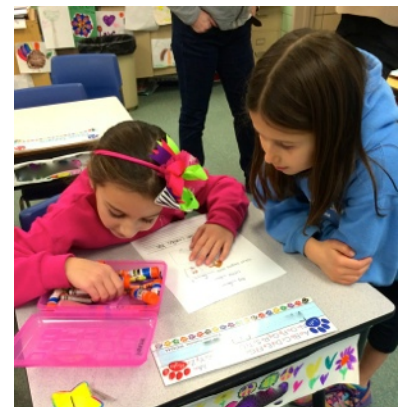
Franklin reading buddies creating an A-B-C page.