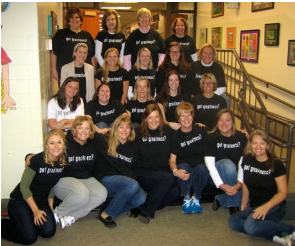
Field staff in their “Got Greatness?” T-shirts; the back of the shirt, of course, responds: “Field School does!”