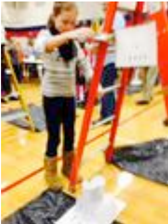
The egg drop was one of five events at the Olympiad.