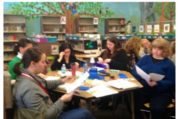
Grades K-2 math teachers had an opportunity to work together to review pacing guides, and learn engaging and effective practices for instruction addressing the new math CCSS.

On Friday, February 6, all District 64 staff participated in professional development activities. Professional Development days are opportunities for teacher teams to learn more about "best practices" in their subject areas. For many teams, activities focused on the integration of technology to support student learning and on developing instructional strategies to support the implementation of the Common Core State Standards (CCSS). Other themes included differentiation, student engagement, and supporting struggling students with positive behavior choices.