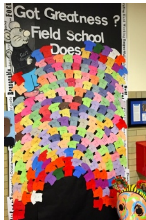
Students created their own “Got Greatness” T-shirts, too!