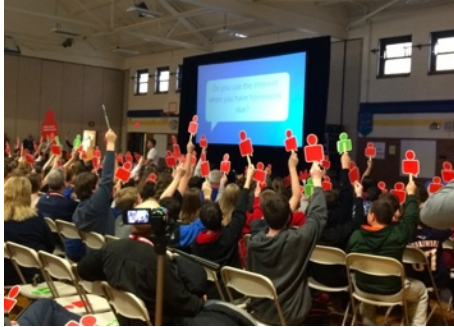
Lincoln students enjoyed the interactive presentation!

❖ Jefferson - Students in a speech therapy session were diligently working on saying target sounds in short sentences. In another classroom, students were learning about dinosaurs.