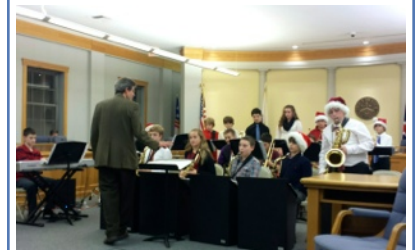
At the Mayor's invitation, Lincoln's Jazz Band brought the holiday spirit to the City Council in December!