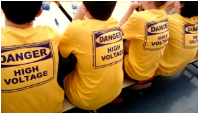
T-shirts reinforce for students: “YOU have the POWER to make your own decisions!”

More than 400 8th graders from our two middle schools joined together at Emerson after school on Friday, February 27 for District 64’s annual POWER workshop. Two inspiring motivational speakers encouraged the young teens to “live their best life ever.” Trained high school leaders met with small groups of students for collaboration and questioning, helping build the skills to develop healthy peer relationships, resist negative peer pressure, and promote responsible decision-making as they grow up. A fun, exciting slideshow capped off this positive, educational and uplifting event.