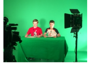
Emerson students learn production skills at the digital media lab funded by a grant from the Elementary Learning Foundation. The lab was used recently to tape a series of podcasts on the CEC audit findings.

As you know, District 64 engaged the Consortium for Educational Change (CEC) to identify areas of strength and opportunities for improvement within District 64 through conducting an audit. This District-level process -- called a "System Overview Assessment" -- offers us an opportunity to benchmark ourselves against effective practices of other high performing districts in the areas of learning, collaboration and results. Special thanks to the almost 1,000 parents, staff and students who participated in small group sessions with the visiting team during their work here last month. The CEC findings will be shared with the Board of Education on March 23 and a series of podcasts are now being prepared to review the findings in each area. The results will immediately inform the work of our Strategic Plan Steering Committee, and will inspire many conversations going forward as the District focuses on continuous improvement.