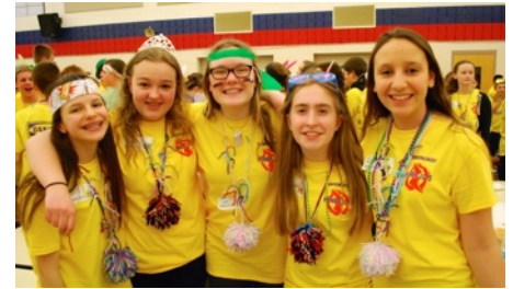
Every year, students tell us POWER was one of the best experiences of middle school!

More than 400 8th graders from our two middle schools joined together at Emerson after school on Friday, February 27 for District 64’s annual POWER workshop. Two inspiring motivational speakers encouraged the young teens to “live their best life ever.” Trained high school leaders met with small groups of students for collaboration and questioning, helping build the skills to develop healthy peer relationships, resist negative peer pressure, and promote responsible decision-making as they grow up. A fun, exciting slideshow capped off this positive, educational and uplifting event.