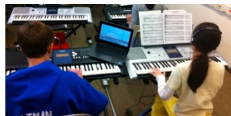
Keyboarders practice their skills at Lincoln.

❖ Washington - A visit in early March from author Amy Krouse Rosenthal helped inspire K-5 students' own love of words and the clever word play she incorporates in her popular books. Students also enjoyed getting her autograph!