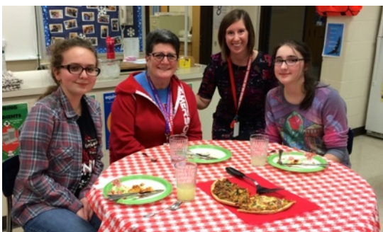
As a culminating activity in 8th grade FACS, Emerson students make pizza and invite members of the faculty to dine with them. The pizza was delicious!

how we feel when we help other people. Helping others was the theme of the storybooks teachers read at circle and library times, too.