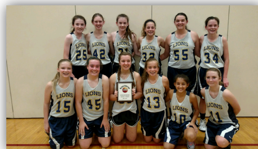
8 th Grade Team

The 8 th grade team finished their season with a 19-3