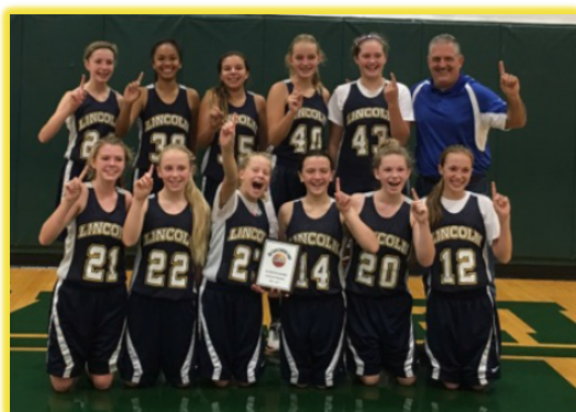
7 th Grade Team

There is plenty of high level excitement in the gym now that our tournament is underway. The top four winners from Pool 1 and Pool 2 are being determined to advance to the championship bracket. Students are doing their best to get their faculty member to last through the matches. The Golden Volleyball Trophy is waiting to be inscribed with the winner. Good Luck to everyone!