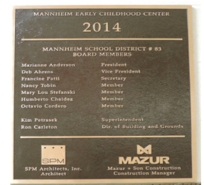
Mannheim Early Childhood Center Plaque