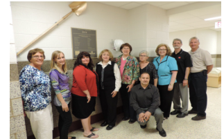
School Board Members, Superintendent, Architects, Building and Grounds Director