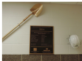
Ground breaking shovel, hardhat and dedication plaque.