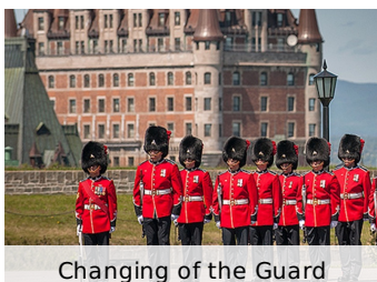
Changing of the Guard