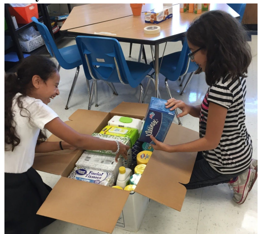
Student Council members packing up supplies that Elmwood students collected for Lurie Children's Hospital.