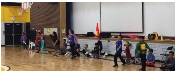
5th graders participating in the hoop glider competition!

"If you are proactive, you don't have to wait for circumstances or other people to create perspective expanding experiences. You can consciously create your own."