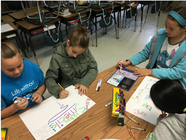
Go Green Club making posters advertising upcoming holiday Smencils sale!