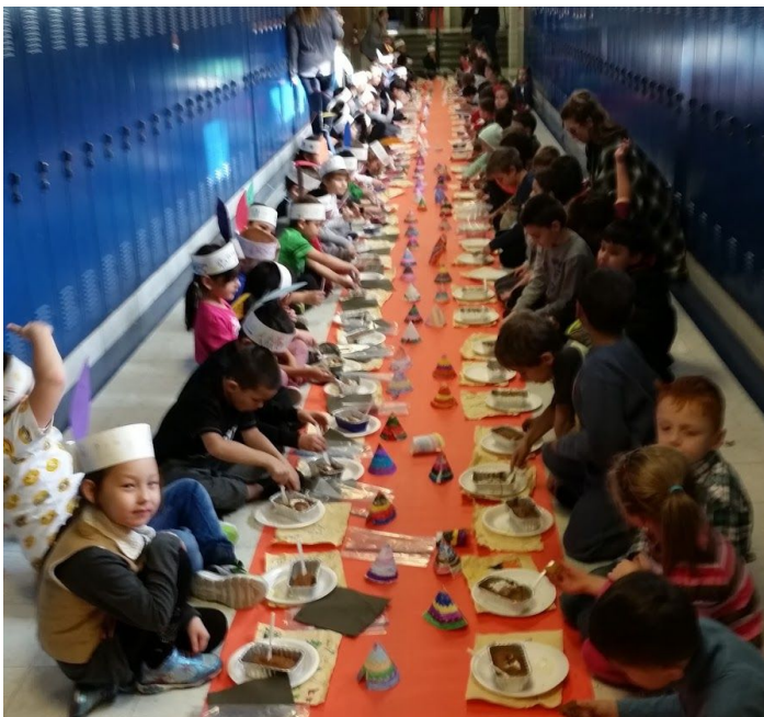
Students helped measure, mix and prepare the items they enjoyed in the annual First grade Thanksgiving feast!

I would like to thank everyone for their patience and support for our long-awaited playground. A special thanks to our School Board and Village for working together to support and make this project a reality. We know our children will enjoy their new playground structure.!