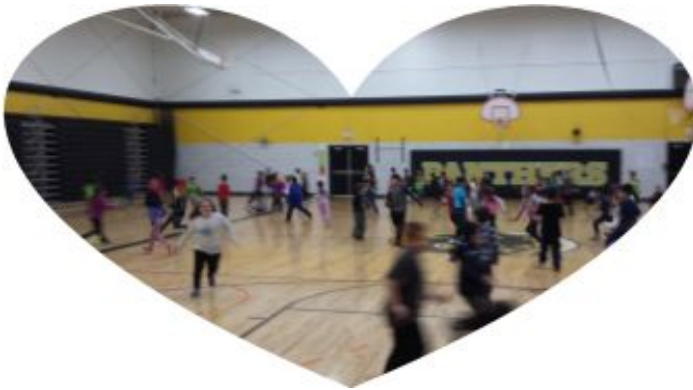
1st graders enjoying a spirited game of tag while improving their cardio endurance.