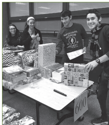
National Honor Society members helped provide holiday gifts for children in need.

a-Kid , Community Easter Egg Hunt, Leadership Week, and Feed My Starving Children . They served as leaders for Eighth Grade Orientation, Open House and Parent-Teacher Conferences, and assisted at the Tiger Tear, Leyden Easter Egg Hunt, and Halloween events. Their good work is celebrated at a banquet and at an end-of-year picnic.