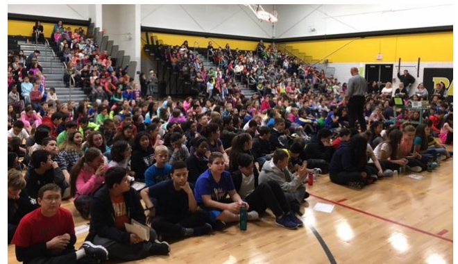
Students at the Second Quarter Honors Assembly!

Follow us on Instagram! ElmwoodSchool401