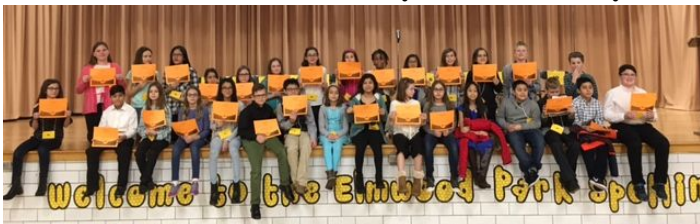
2017 Spelling Bee participants