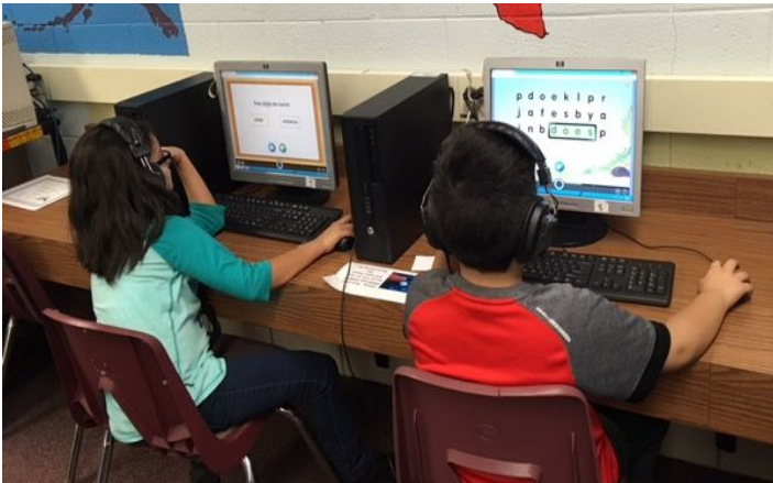
ELL classes introduced and began using Lexia, a personalized reading curriculum for all students. The students are excited and love it!