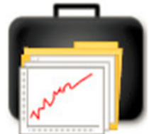
Business, Management & Administration