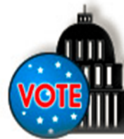
Government & Public Administration