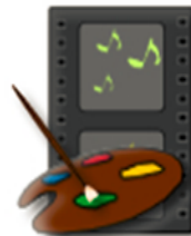
Arts, Audio/Video Technology & Communications