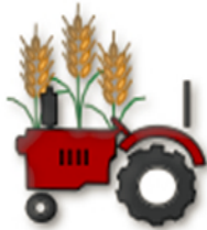
Agriculture, Food & Natural Resources