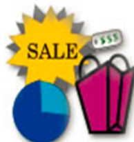
Marketing, Sales & Service