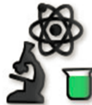
Science, Technology, Engineering & Math