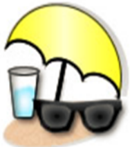
Hospitality & Tourism