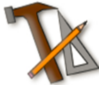
Architecture & Construction