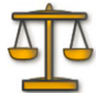
Law, Public Safety, Corrections & Security