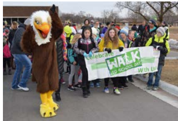
Students from Westside Elementary School participated in a Walk to School event where they learned about Safe Routes to School.

Safety is a top priority for the Kimberly Area School District. Upgrading infrastructure is important, but staff and students must also be prepared for a variety of emergencies. Communication between staff, students, parents and community agencies builds awareness and improves the response to emergency situations. It takes everyone working together to improve school safety.