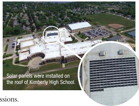
Solar panels were installed on the roof of Kimberly High School.

View a presentation on eco-friendly updates at https://goo.gl/H7K1ud