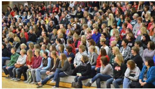
All staff participated in a police-led active shooter training and drill.

The safety team ensures their school is holding practice drills for fires and severe weather. They also conduct tabletop exercises to simulate different scenarios, such as intruders, accidents and medical emergencies.