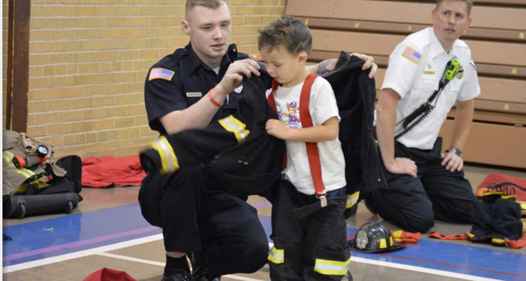
Local firefighters taught students at the 4K Center for Literacy about fire safety during National Fire Prevention Week.

OUR VISION: Students will grow as problem solvers to reach their potential in academics, arts and co-curriculars.