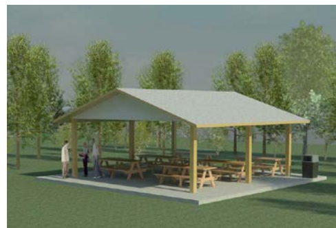
Support from We Energies is helping to make the future Outdoor Learning Center in the school forest at KHS a reality.

Throughout the school year, a variety of organizations and businesses approach the District with a need they have in our community. One example is a recent partnership with We Energies that is providing new opportunities for Kimberly students. The company installed energy equipment on a small piece of KHS property late this summer and in return We Energies established a $30,000 scholarship fund for KHS students pursuing further education related to the trades at a two-year technical college. We Energies also provided donations to support the construction of a covered Outdoor Learning Shelter in the KHS school forest and placement of an educational sign in the forest.