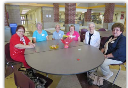
Senior citizens from the community are invited to the monthly Senior Quest program hosted by the District and the Village of Kimberly.

Another initiative taking shape in the Town and Village of Harrison is the creation of a new community park. Harrison approached the District as a community partner to help identify co-curricular groups, clubs and organizations in the community that are in need of additional park facilities. "We were able to