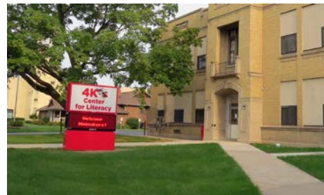
Kimberly's 4K Center for Literacy opened for the 2015-16 school year.

The 4K Center for Literacy, located in downtown Kimberly, revitalized a community building that was sitting empty due to the closure of the Appleton Christian School in 2014. While one of the first districts in the state to have four-year-old kindergarten, KASD was last to offer a full-day five-year-old kindergarten option. The District found that parents wanted the District to offer a full-day 5K option. This change doubled the amount of classroom space needed for 5K in 2015-16. In order to keep the 4K program, the District created the 4K Center for Literacy. The response to the 4K Center has been very positive, 301 students now attend school in the revitalized building.