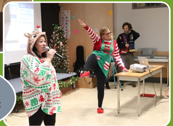
Various pictures of our WestSide's Got Talent 5th Annual Talent Show!