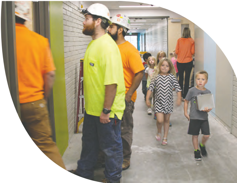
Construction crew works side by side with kindergartners at the Early Childhood Learning Center adjacent to Washington Elementary School. The building was modernized as part of the Construction Bond.