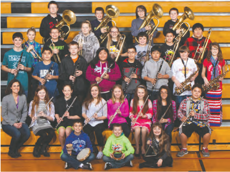
Pioneer Beginning Band