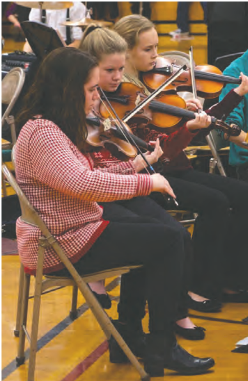
Pioneer strings