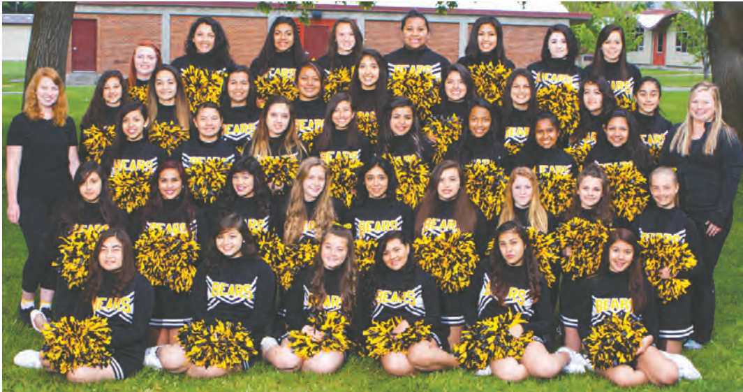
Pioneer Drill Team