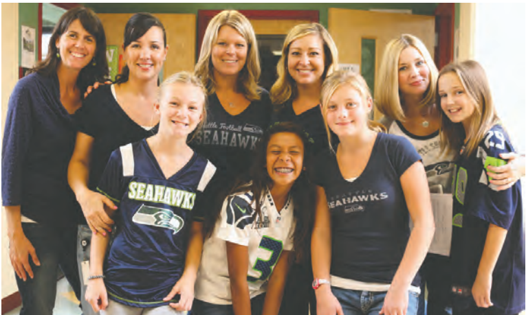
Students and teachers