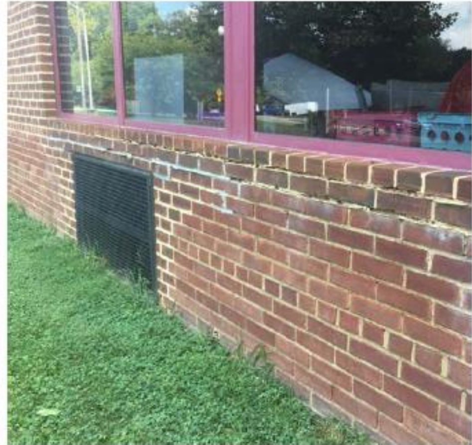
Many areas require repointing below windows