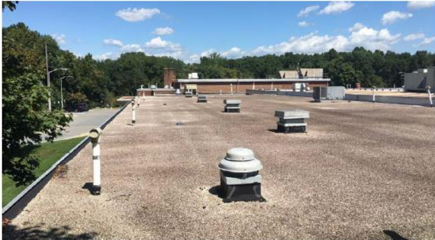
Overview of built-up asphalt roof at original construction south wing