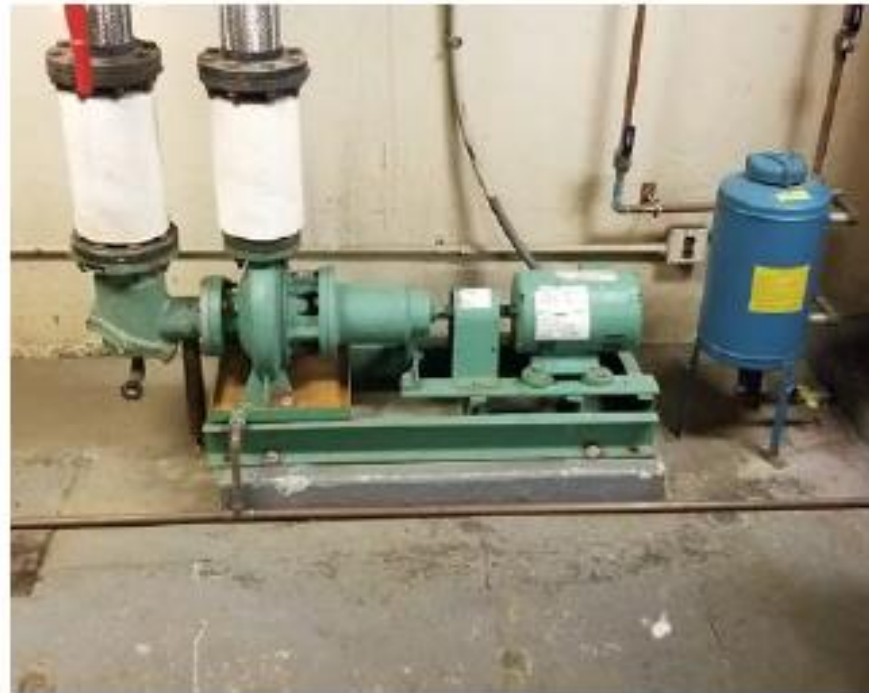
Main mechanical room pumps