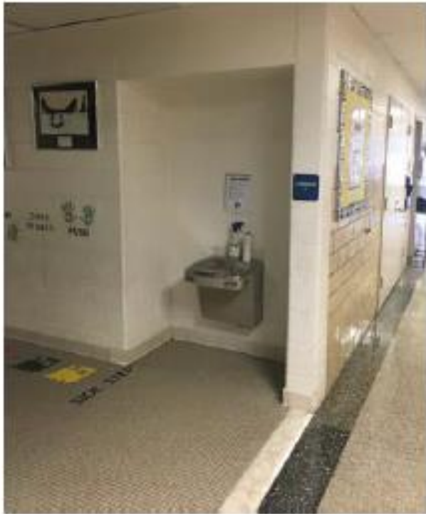
Drinking fountain is not an accessible high-low type