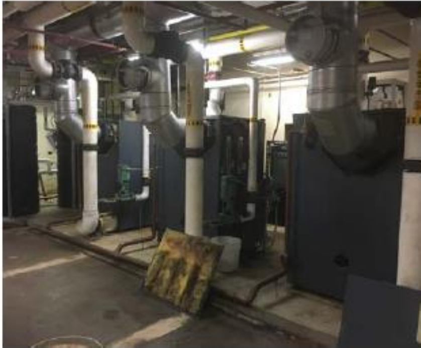
Main mechanical room boilers