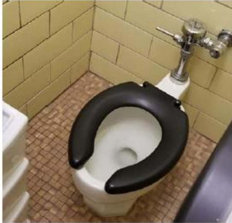
Single-user toilet rooms are not ADA compliant due to size and door width