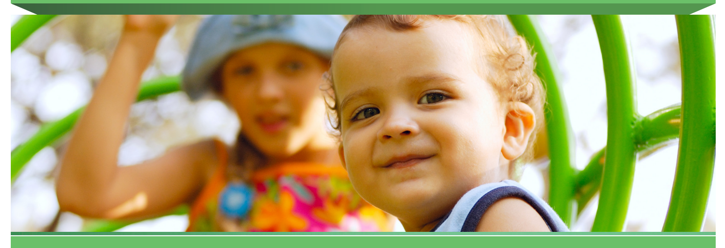
We'll do whatever it takes and then some.