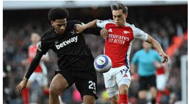
(Arsenal player Trossard fighting for the ball)

On Feb 22nd, Arsenal faced off against West Ham. Arsenal, in 2nd place behind Liverpool were the clear favorites against 16th placed West Ham.