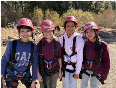
In this picture, you can see a group of girls about to go on the zipline

There are many kinds of activities where you are able to experience different things. Ziplining is one of the activities. You can look at nature from above