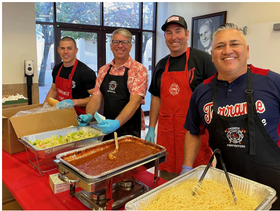
(Last Years TFFA Spaghetti Dinner)

The Torrance Firefighters Association would like to invite you to participate in their 51st Annual Spaghetti Dinner and Bake Sale. This event takes place on 03/08/2025 4:30 PM - 8:00 PM benefiting the Alisa Ann Ruch Burn Foundation and CHAMP CAMP! Over the years, The Torrance Firefighters Association have proudly served over 52,000 meals and raised over $230,000. Your donations sponsor young burn survivors at CHAMP CAMP every summer!