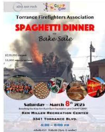
(TFFA Digital Promotion Flyer for Spaghetti dinner)

volunteers at the Spaghetti dinner are burn victims, so it makes them feel good about what they do. He also stated that the community knows they help too and that they play the largest role in the fundraiser.