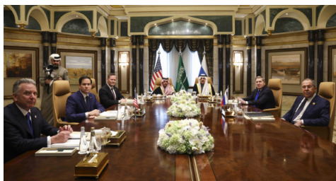
Russian and U.S officials meet in Saudi Arabia without Ukraine.

The absence of Ukrainian representatives at this meeting is a major problem. This can hinder the country's ability to participate effectively in and influence international affairs.