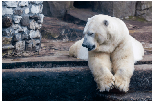
A picture of a polar bear in a zoo

Confinement in artificial settings strips creatures of the ability to engage in instinctive, natural behaviors—a fundamental right that no captive enclosure can ever fully replace. In an era where animal rights and welfare are increasingly prioritized, it is time to question whether maintaining zoos is a compassionate or responsible path forward.