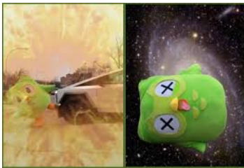
Duolingo's death.

On Tuesday, February 11, Duo- full name Duo Keyshauna Renee Lingo, the very popular mascot of the multi-billion dollar company Duolingo, allegedly died from getting hit by a cybertruck. This began a spur of mourning and grief as other brands and organizations were inspired by its death. Meanwhile, people are unsure who committed the crime. One thing is for sure, though, Duolingo used its mascot's death in order to gain profit and more popularity, and is it a lie for something bigger?