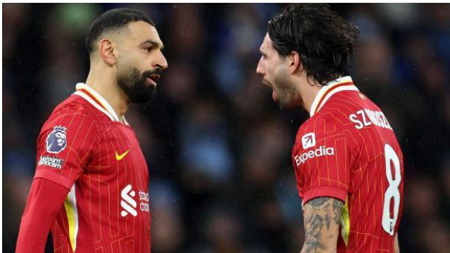
(Salah and Szoboszlai celebrating their goal)

The match started and Liverpool were showing why they are at the top of the league, constantly attacking and attacking. They were attacking so much that in the 14th minute of the game M. Salah was assisted by D. Szoboszlai for the first goal of the game. This goal gets Salah his 40th goal contribution this season.