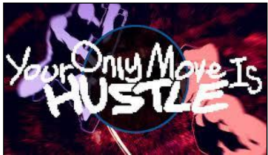
Only Move is Hustle, developed by Ivy Sly.

Released in 2023, the game was a quick hit. Its single player mode is like a fight creator, where you pick both of the characters' actions, and go until a character's health bar is depleted, or until the timer runs out. After all that, you have