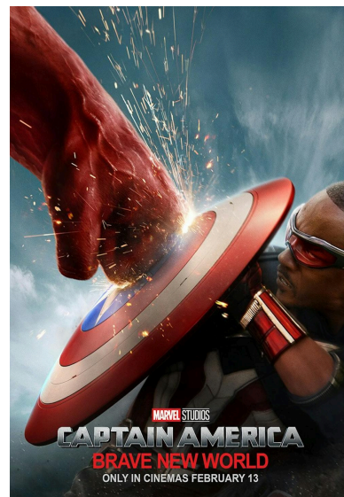
(Captain America: Brave New World Poster)

2025 has already shown that it will be a big year for movies. One huge movie that just recently came out is the highly anticipated, Captain America: Brave New World, from Marvel Studios.