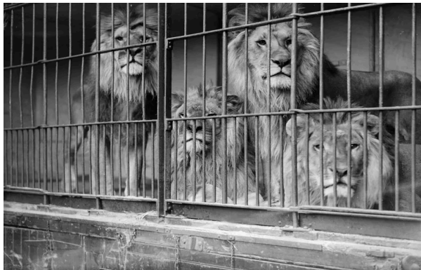
A picture of a pride of lions being caged

Despite claims that zoos help prevent the extinction of many exotic animals, the reality is that many animals suffer both physically and mentally in captivity. Animals are often confined to small enclosures that fail to mimic their natural habitats, limiting their ability to roam, hunt, or socialize as they would in the wild.