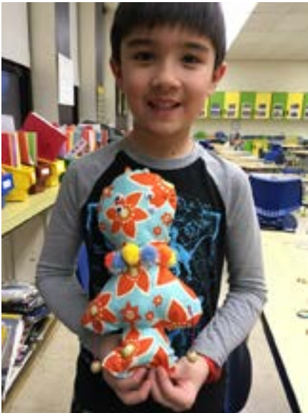
Top: Gabe, Sweet Potato Print Bottom: David, Nick Cave-Inspired Doll

Nick Cave (b. 1959) has created over 500 “Sound Sculptures” that can be worn in a performance or that can be displayed as a sculptural object. Many are very colorful, heavily embellished and made with a variety of materials, from sticks to feathers and sequins. Cave is concerned with matters of race, identity and gender. Ms. Gillet asked the students to create “dolls” inspired by Cave’s sound sculptures, to embrace differences and to do away with labels. Students could use precut shapes for their dolls or create their own. A variety of materials including patterned fabric, sequins, buttons, feathers, beads, googly eyes, and found objects were available to create the dolls. Every “doll” made was unique and quite a treasure!