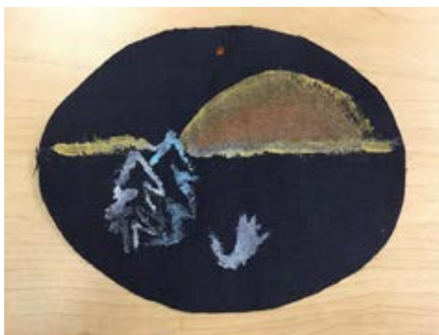
Top L: Yusef, Bird of Prey and Super Moon; Top: R: Cloud Gate, Millennium Park; Middle L: Striking a pose at AIC; Middle R: Shape Play; Bottom L: Shape Play, PacMan; Bottom R: Salma_Wolf and the Super Moon